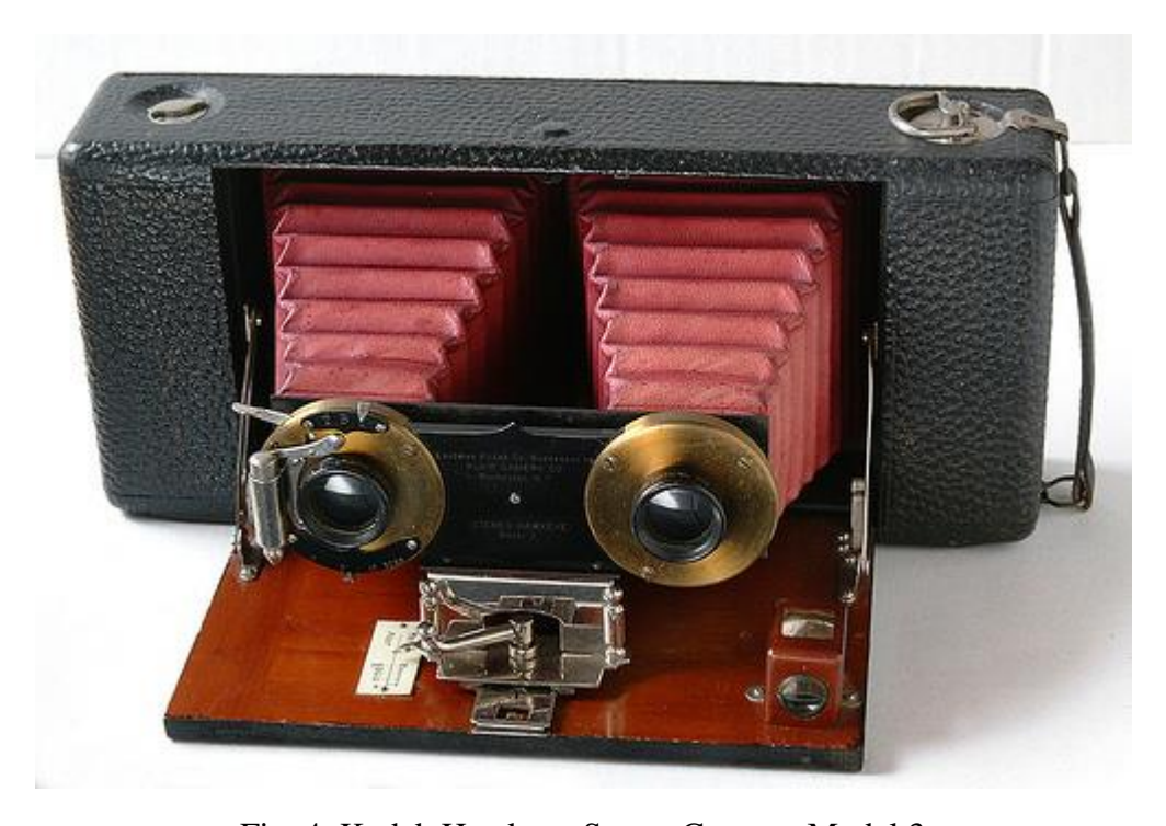
Fig. 4. Kodak Hawkeye Stereo Camera, Model 3