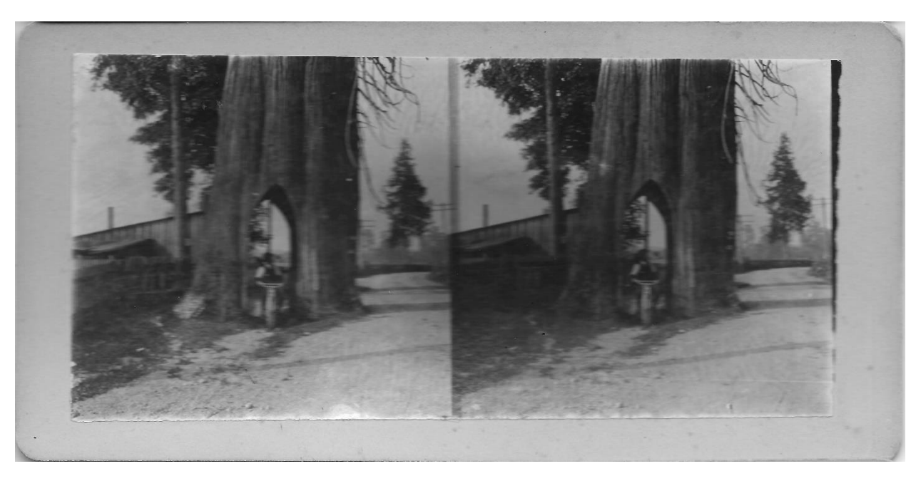
Fig. 6. Snohomish Bicycle Tree, located a mile south of the city, along the Woodinville-Snohomish Road (Highway 9), c.1910