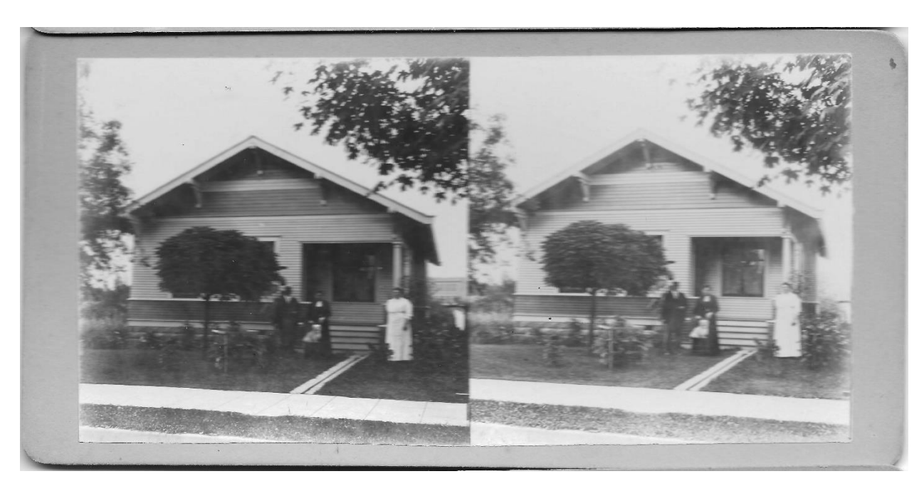
Fig. 8. E.P. Shipp Home, 337 West Main Street, Monroe, c.1910 (Shipp family members? Union High School in the distance.)