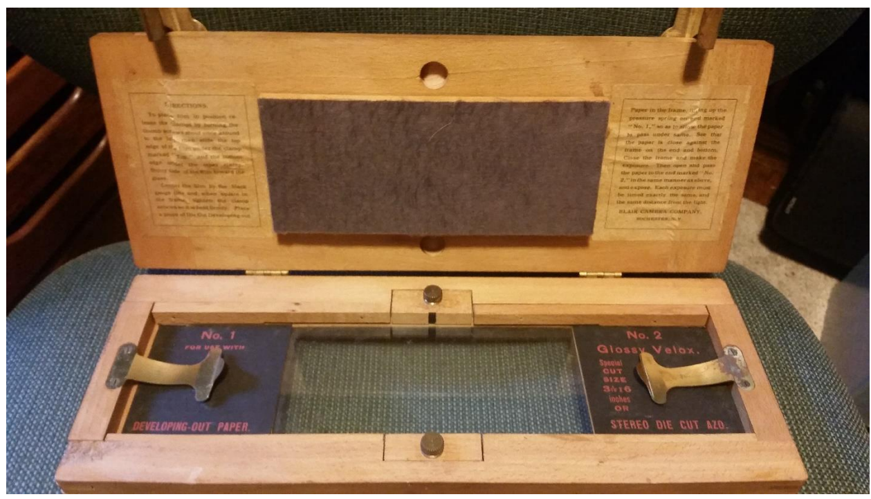
Fig. 3. Kodak Stereo Hawk-Eye Self-Transforming Printing Frame