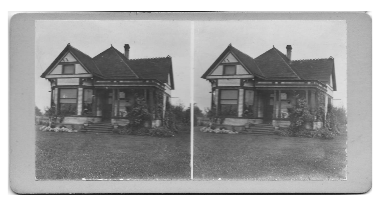
Fig. 7. C.F. Elwell Home, 421 West Main Street, Monroe, c.1910