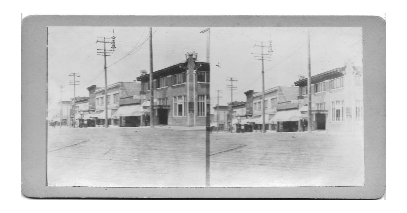
Fig. 1. First and Union Avenue, Snohomish, c.1910