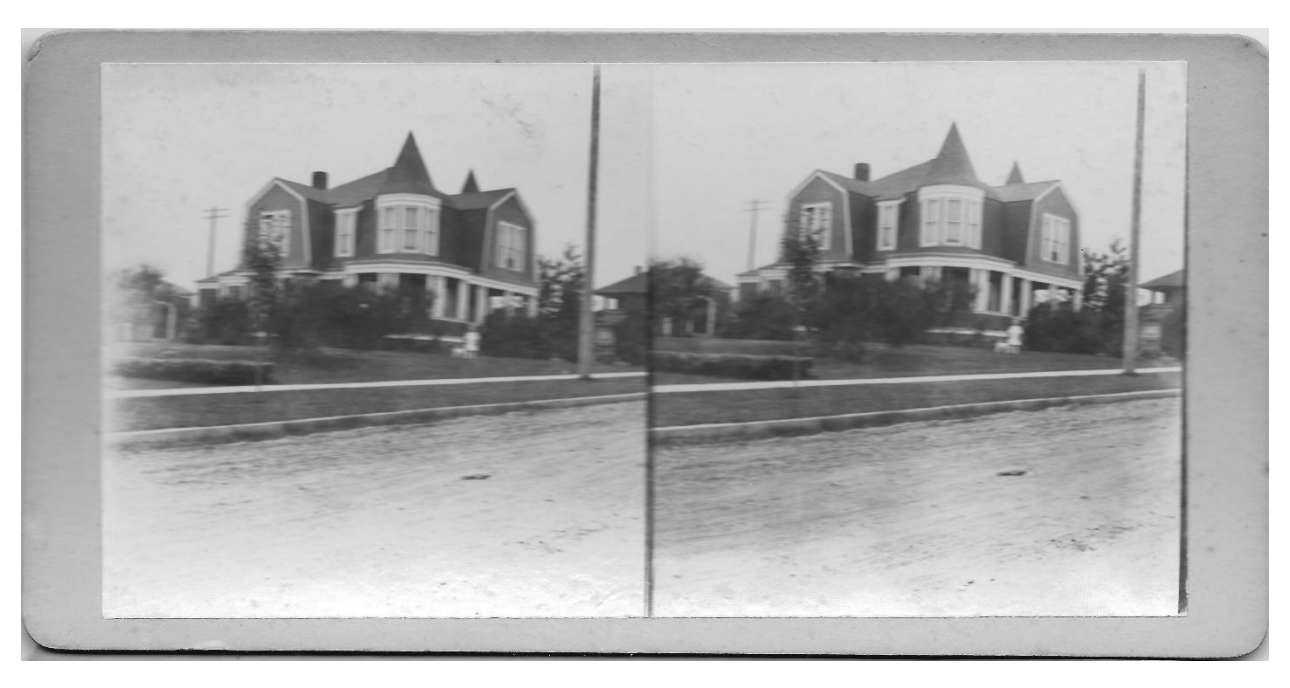
Fig. 5. A.M. Blackman House, Fourth and Avenue D, Snohomish, c.1910